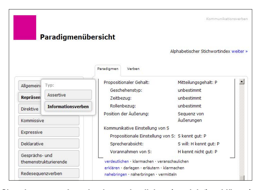
Fig. 2: Situation type referred to by verdeutlichen (,explain'), erklären (,explain') and nahebringen ('bring sth. home to sb.') and their synonyms.

Different degrees of synonymity may also be observed among the verbs of the field containing the lemmatised verbs verdeutlichen ('explain'), erklären ('explain') and nahebringen ('bring sth. home to sb.'). These verbs and the synonyms of each of these all express the concept of a verbal action whereby a speaker who knows something (P: a past, present or future action, event or state of affairs) well and assumes that H does not have sufficient knowledge of P makes several utterances to make H know P well. In Kommunikationsverben in OWID, information about special resource situation types is represented in the section Paradigmenübersicht ('overview of paradigm'). The screenshot in Figure 2 represents the special resource situation type referred to by verdeutlichen , erklären and nahebringen and the synonyms of each of them: