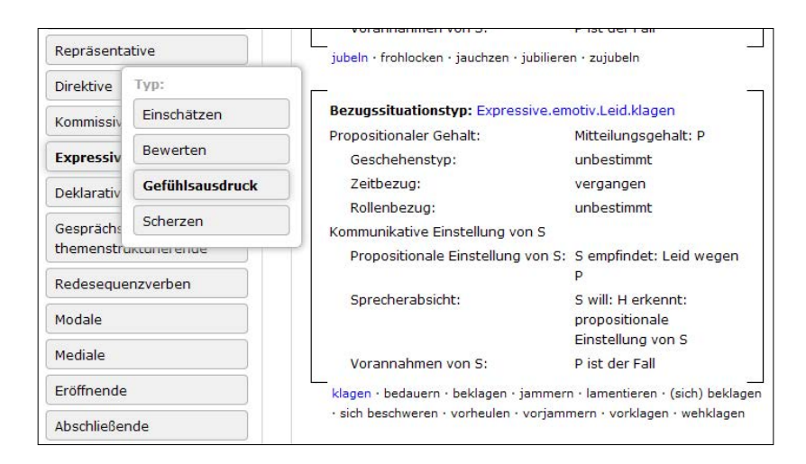
Fig. 6: Situation referred to by klagen ('complain') and its synonyms.

None of the verbs which are part of the field represented in Figures 2-5 share any special contextual restrictions on the basis of which they may be claimed to be even closer synonyms. Synonymy relations of this kind may be observed from a comparison of the contextual restrictions associated with the use of the verbs klagen ('complain'), jammern ('moan') and lamentieren ('lament'). These verbs are used to refer to situations in which a speaker who feels sorrow because of something (P: a past action, event or state of affairs) makes one or more utterances with the intention that the hearer recognize that he/she, i.e. the speaker, feels sorrow because of P. The situation referred to by klagen and its synonyms is represented by the screenshot in Figure 6: